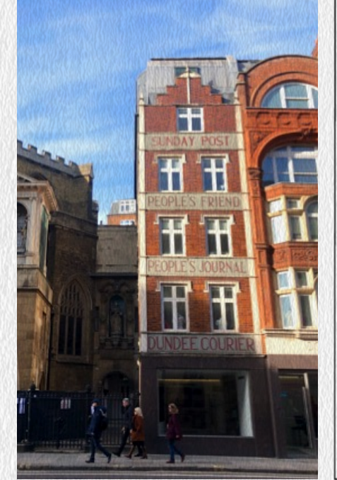
One of the alleged homes of