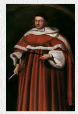
Sir Matthew Hale, one of the Fire Court Judges

A quorum of 3 judges constituted the Court, which sat in the Hall of Clifford Inn in Fetter Lane, which had escaped the fire. The judges had the power to cancel contracts, and to decide whether the landlord or the tenant should be responsible for rebuilding the property. The first session of the Court was on 25th February 1667. The judges sat at a small table which is now preserved in the Museum of London and was exhibited at their "Fire of London" exhibition. This gate-leg oak table was used by the Fire Court at Clifford's Inn. A brass plaque fixed into the end of the table bears the inscription: 'Sir Matthew Hale & the other Judges, sat at this Table in Cliffords Inn to determine the disputes respecting Property, which arose after the Great Fire of London AD1666. Presented by R.M.Kerr Esq. L.D. 1893.'