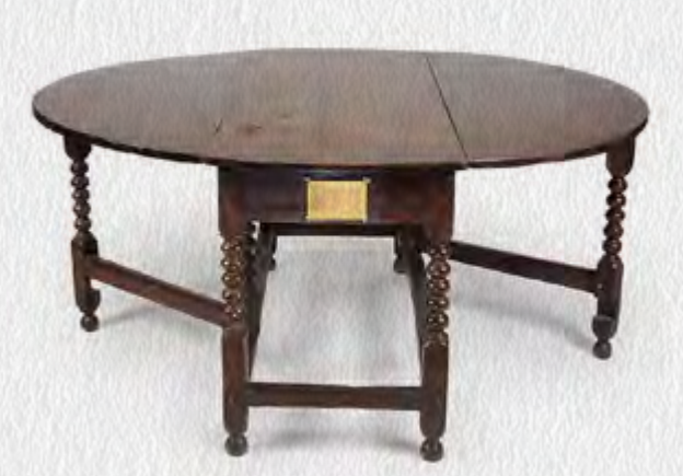
The Fire Table, at which the Fire Court Judges sat in Cliffords Inn

The solution was quite extraordinary. The Fire of London Disputes Act of 1666 created a Fire Court of 22 judges, which had sweeping powers to settle all differences arising between landlords and tenants of burnt buildings. The judges were drawn from the Kings Bench, the Court of Common Pleas, and the Court of the Exchequer.