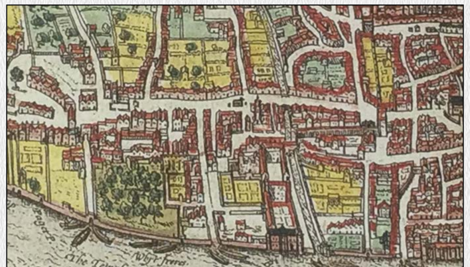
Map of Tudor London, Hogenberg, 1572

In about 1500, Wynken de Worde, the inheritor of Caxton's printing business in Westminster, moved his press to the vicinity of St. Bride's Church, and thus started the long association of Fleet Street and the printing industry.